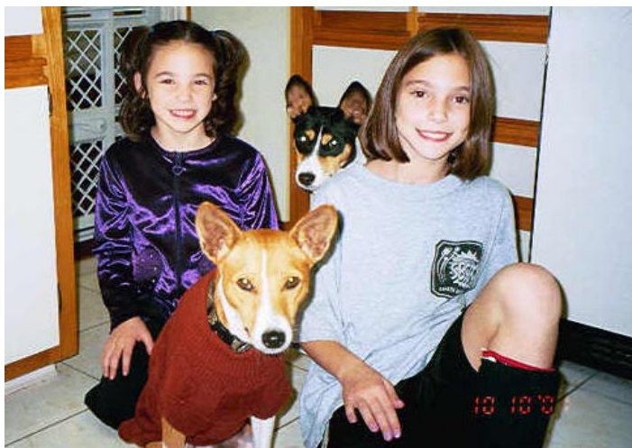
Getting ready to hit the soccer field on a cool, fall day